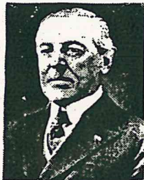
President Wilson, who has vowed to maintain U.S. apathy.

From the London and Washington Bureaus, Aug. 4.—After weeks of unbearable tension following the assassination of the heir to the Austro-Hungarian throne, the great European powers have declared war on one another in a bitter struggle for something that is sure to be determined by war's end. Enmeshed in a confusing string of rivalries and alliances, diplomats, politicians, and military leaders