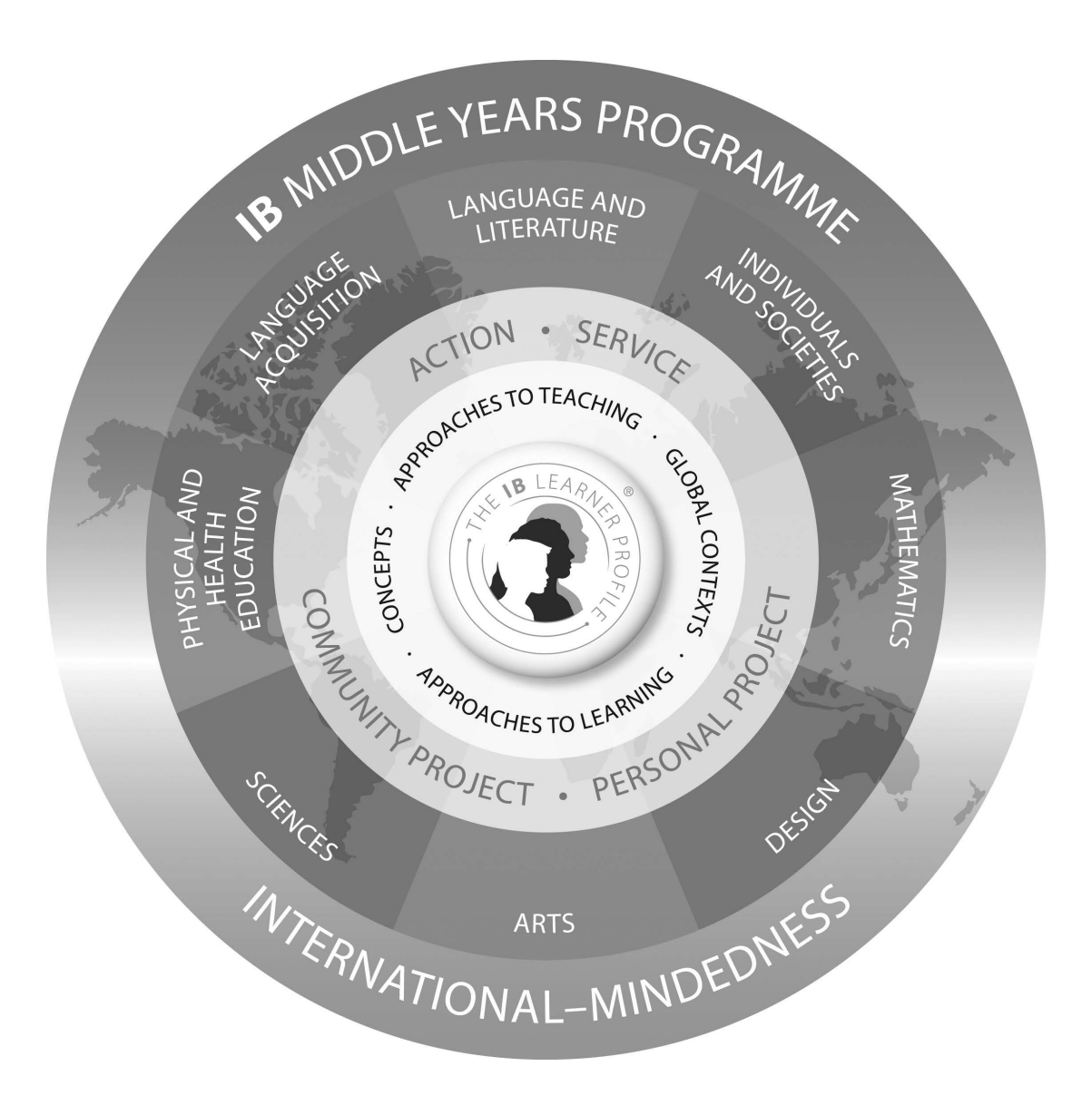
Figure 1 Middle Years Programme model

The MYP is designed for students aged 11 to 16. It provides a framework of learning that encourages students to become creative, critical and reflective thinkers. The MYP emphasizes intellectual challenge, encouraging students to make connections between their studies in traditional subjects and the real world. It fosters the development of skills for communication, intercultural understanding and global engagement—essential qualities for young people who are becoming global leaders.