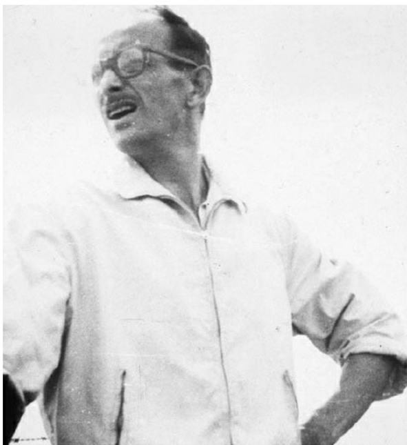
Adolf Eichmann- A.K.A. Riccardo Klement 1959.

Red Cross Travel Document prepared for Otto Adolf Eichmann, a.k.a., Riccardo Klement. This document allowed Eichmann to leave Europe via Italy, enroute to Argentina.