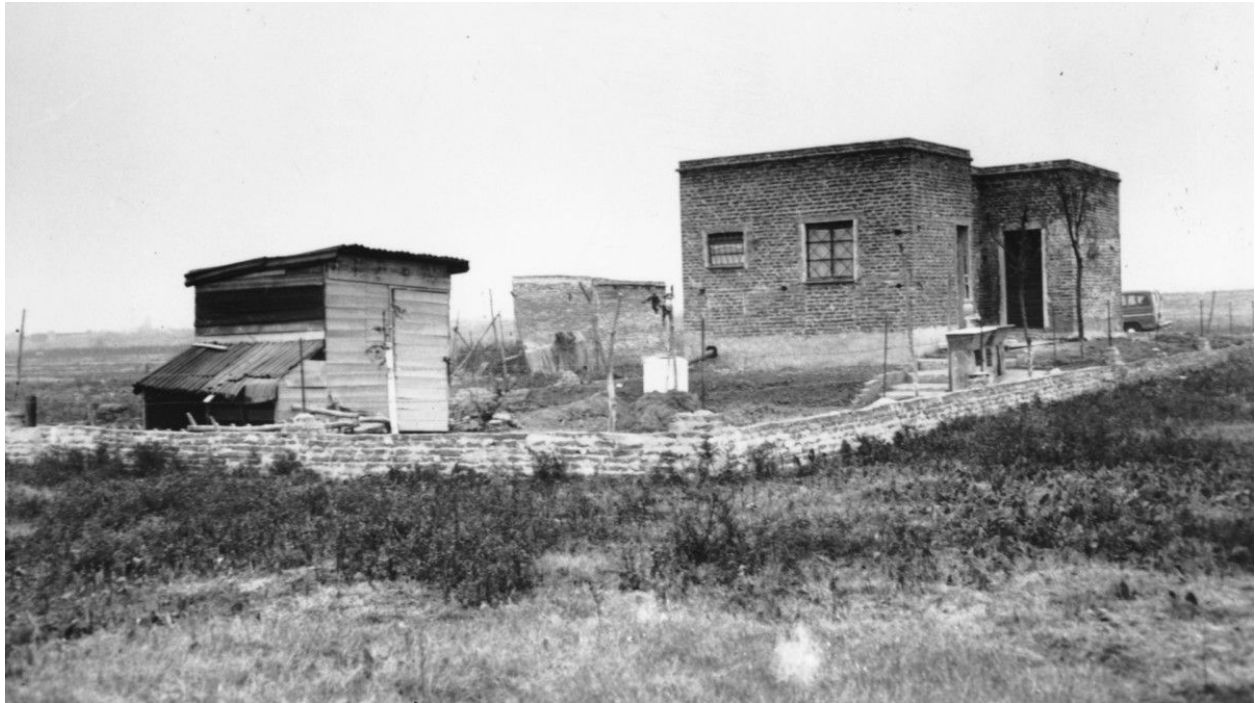
The home of Otto Adolf Eichmann's (a.k.a. Klement Ricardo) on Garibaldi Street in San Fernando, Argentina, 1950.