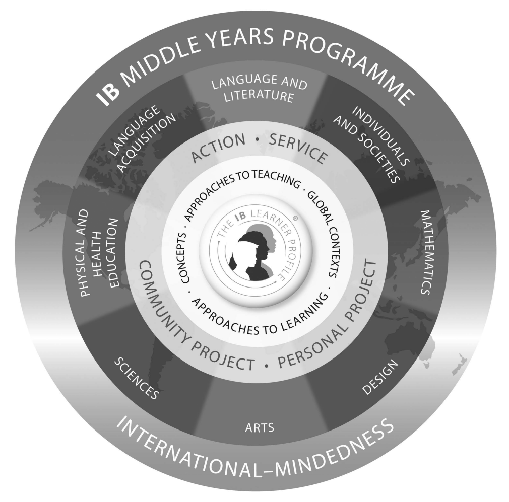
Figure 1 Middle Years Programme model

The MYP is designed for students aged 11 to 16. It provides a framework of learning that encourages students to become creative, critical and reflective thinkers. The MYP emphasizes intellectual challenge, encouraging students to make connections between their studies in traditional subjects and the real world. It fosters the development of skills for communication, intercultural understanding and global engagement—essential qualities for young people who are becoming global leaders.