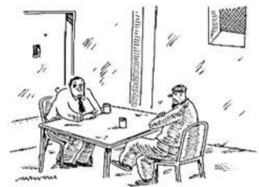
"I'm neither a good cop nor a bad cop, Jerome. Like yourself, I'm a complex amalgam of positive and negative personality traits that emerge or not, depending on circumstances."